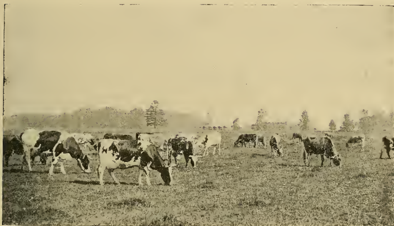
STOCK AT PASTURE

Students taking this course are required to take Course 3. MR. COONS.